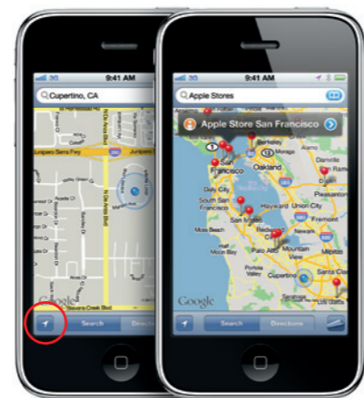
Google, the Google logo, and Google Maps are trademarks of Google Inc. © 2011. All rights reserved.

To see where you are on a map, tap the Location button. A blue dot appears at your current position. To see which way you're facing, tap the Location button again to turn on compass view. Find places around you by typing words like "Starbucks" or "pizza" in the search field. Double-tap to zoom in. Tap once with two fingers to zoom out. You can also get directions or tap the Page Curl button for additional map views.