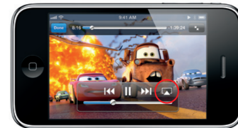
Cars 2 will be available on iTunes beginning November 1, 2011. Cars 2 © Disney/Pixar. *Requires second-generation Apple TV.

While playing music or watching a movie, tap anywhere on the screen to bring up the controls. Tap again to hide them. To stream your music or video to an Apple TV, tap the AirPlay button.* From the Lock screen, you can double-click the Home button to quickly access your audio controls.